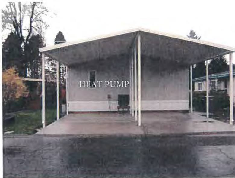
EAST SIDE OF BUILDING – Photo Taken 03-04-2014