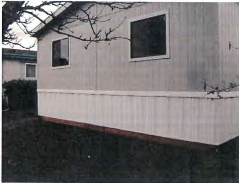
WEST SIDE OF BUILDING – Photo Taken 03-04-2014